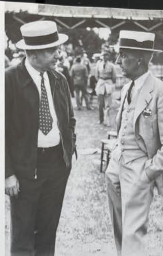
LEFT: 1912 Indianapolis 500 winner Joe Dawson (left) talks with 1911 winner Ray Harroun during the 1936 race.