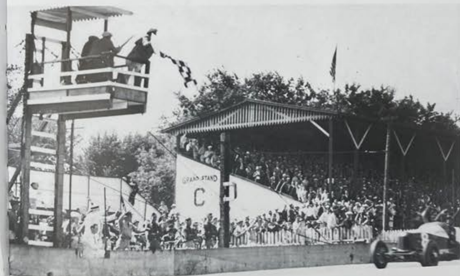
BOTTOM: Louis Meyer takes the checkered flag.