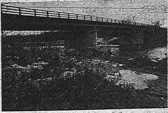
SHOES FOUND ON 21ST STREET BRIDGE OVER EAGLE CREEK Similar To Shoe Found In Assistant Manager's Car