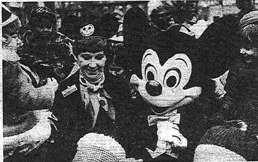
Big Welcome For Little Mouse

The world's most famous mouse, Mickey, to participants in the Mickey and Minnie Look-A-